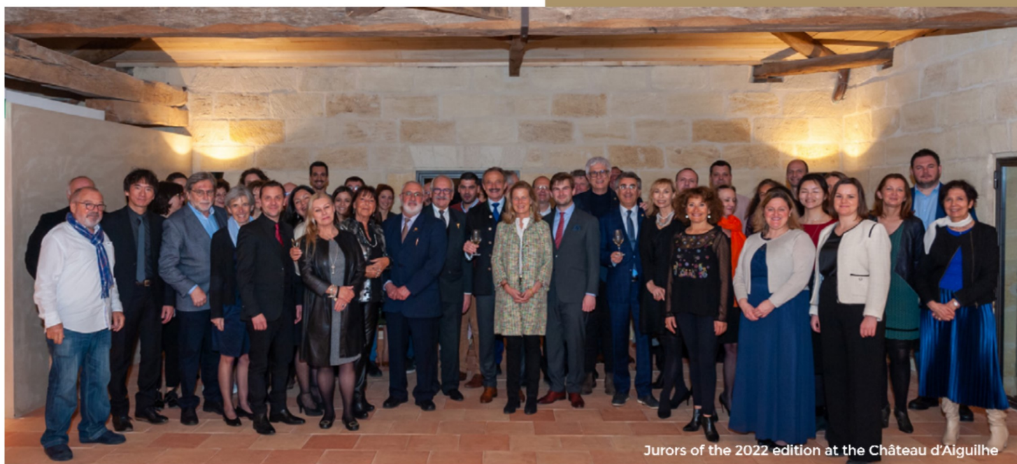
Jurors of the 2022 edition at the Château d'Aiguilhe