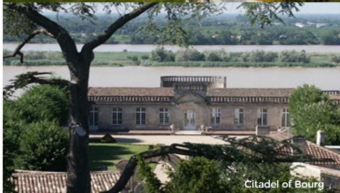
Citadel of Bourg