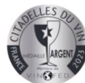
Adhesive medals recognized all over the world