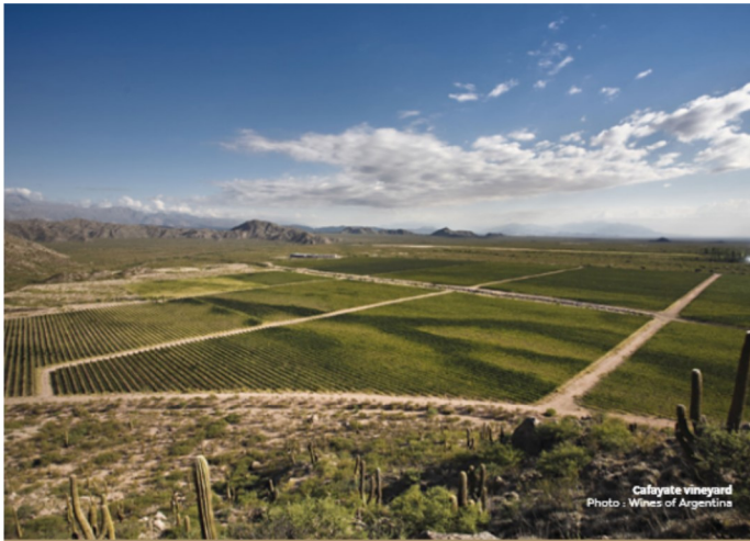
Cafayate vineyard