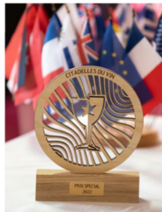
Trophy Citadelles du Vin