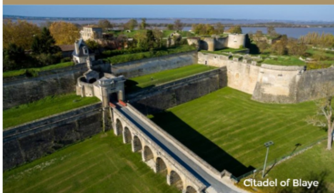
Citadel of Blaye

Strikingly majestic, the citadels of Blaye and Bourg – to which the competition owes its name – watch over the waters of the Gironde Estuary and overlook the surrounding vineyards. Like these sentinel buildings, the Citadelles du Vin competition does everything in its power to fulfil its mission as a bastion of excellence every year.