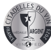
Adhesive medals recognized all over the world