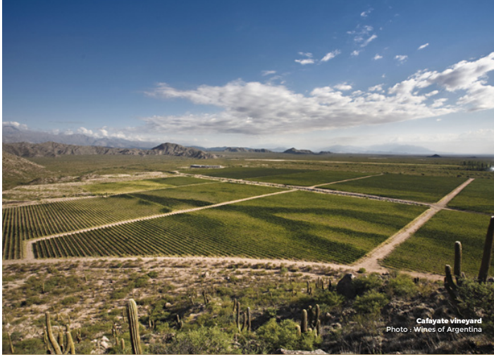
Cafayate vineyard