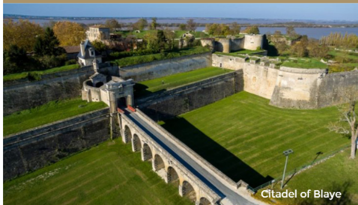
Citadel of Blaye

Strikingly majestic, the citadels of Blaye and Bourg – to which the competition owes its name – watch over the waters of the Gironde Estuary and overlook the surrounding vineyards. Like these sentinel buildings, the Citadelles du Vin competition does everything in its power to fulfil its mission as a bastion of excellence every year.