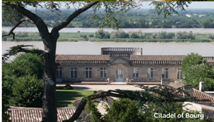
Citadel of Bourg