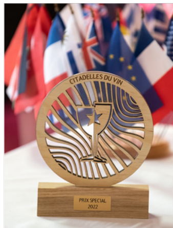
Trophy Citadelles du Vin