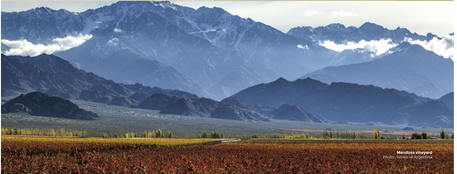
Mendoza vineyard